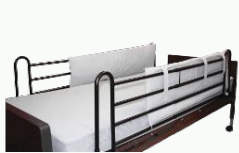
Full Bedside Rails