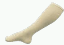
Leg Protection Sleeve