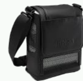
Inogen One G5 Carry Bag Item #CA-500