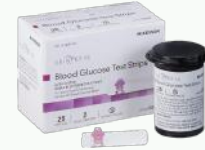
Glucose Strips & Lancets