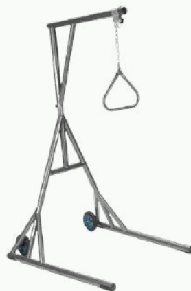
Free Standing or Mounted Trapeze