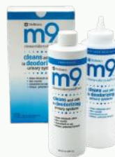
Ostomy Odor Control