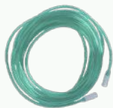
Oxygen Tubing & Connection Green or clear

Your medical supply rep can schedule recurring delivery of O 2 supplies