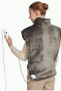
Neck, Shoulders, & Back Heating Pad