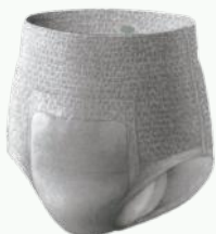
Male Incontinence Pull Ups