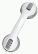
Suction Grab Bar 12" or 16"