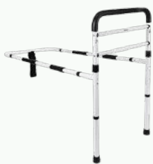
Adjustable Bed Assist Rail