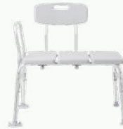
Transfer Bench without Glide Rail