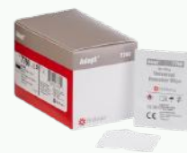
Adhesive and Barrier Remover