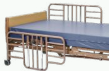
Half Bedside Rails