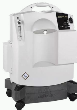
M10 10L Machine