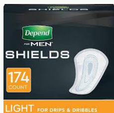
Male Incontinence Shields/Liner