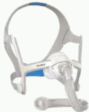
Nasal CPAP Mask