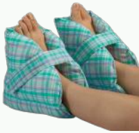
Heel Protection Pad