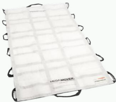
Transfer Sheet MegaMover