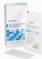
Skin Closure Strip