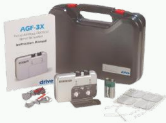
Deluxe Dual Channel TENS