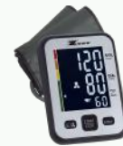
Automatic Blood Pressure Monitor