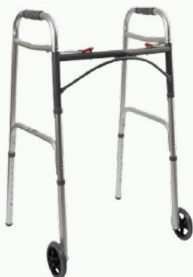
Walker with Wheels