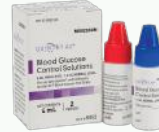
Blood Glucose Control Solution