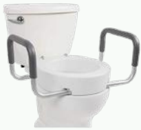
Raised Toilet Seat with Removable Arms