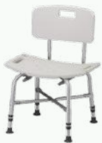
Shower Chair with Removable Back