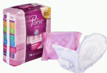
Female Incontinence Guard/Pads