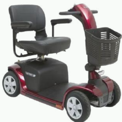
Pride Mobility Victory 9