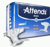
Unisex Incontinence Briefs (with tabs)