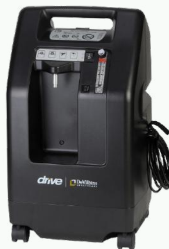
DeVilbiss 5L Machine