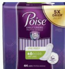
Female Incontinence Shields/Liner