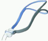
Nasal Pillow Mask