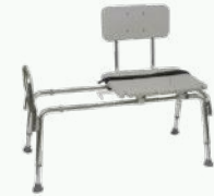
Transfer Bench with Glide Rail