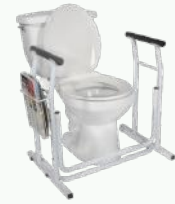
Free Standing Toilet Safety Rail