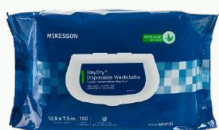
Personal Care Wipes