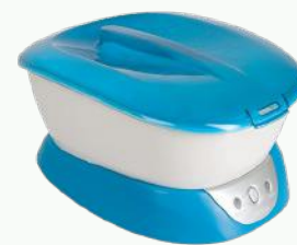
Paraffin Wax Bath