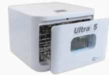
Ultra-5 Ultraviolet Disinfectant