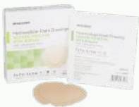
Hydrocellular Foam Dressings