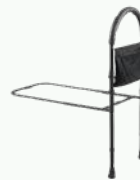
Bed Assist Bar with Storage Pocket