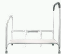
Step-2-Bed Bed Rail