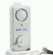
Pull Cord Alarm System