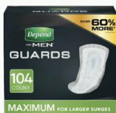
Male Incontinence Guard/Pads