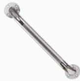
Permanent Grab Bar with Mounting Hardware 12", 16", 18", 24", 30", 32", 36", 42", or 48"