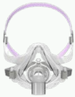
Full Face Mask