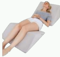
Lisenwood Pillow Set