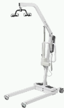
Full Electric Battery Power Hoyer Lift