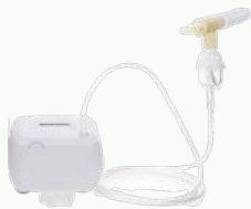
Nebulizer Mouthpiece or Updraft Masks