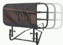
Fold-down Adjustable Bed Rail