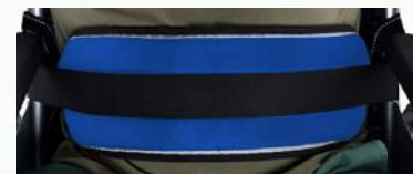
Wheelchair Seat Belt