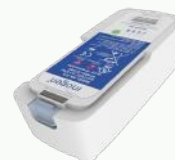
Inogen One G5 Extended Life Lithium Ion Battery Up to 13 hrs run time Item #BA-516