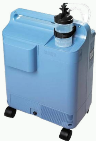
Everflow 5L Machine