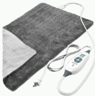
Dry/Moist Heating Pad