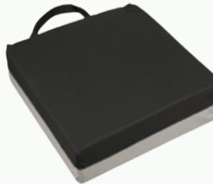
Seat Bottom Cushion

Bariatric options are available in wheelchairs and transport chairs!