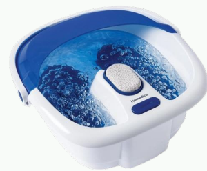
Neuropathy Foot Bath