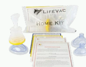
LifeVac Choking Device - Home Kit