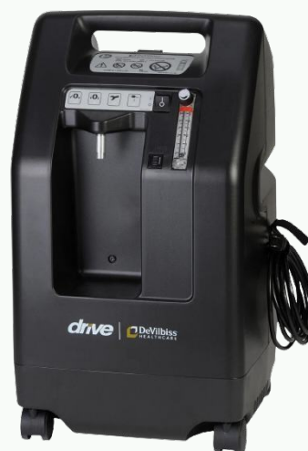
DeVilbiss 5L Machine