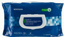
Personal Care Wipes