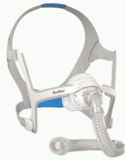
Nasal CPAP Mask