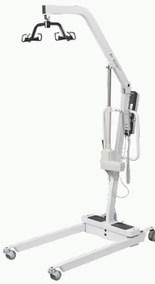
Full Electric Battery Power Hoyer Lift (scale available)