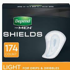
Male Incontinence Shields/Liner