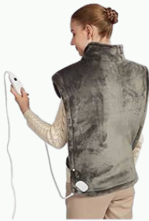
Neck, Shoulders, & Back Heating Pad