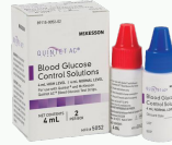
Blood Glucose Control Solution