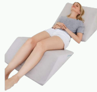
Lisenwood Pillow Set