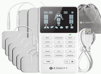
Deluxe Dual Channel TENS