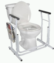
Free Standing Toilet Safety Rail