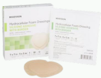
Hydrocellular Foam Dressings