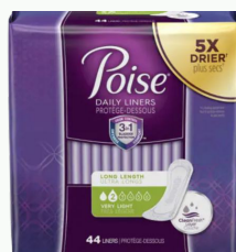
Female Incontinence Shields/Liner