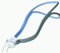
Nasal Pillow Mask