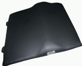
Seat Back Cushion

Bariatric options are available in wheelchairs and transport chairs!