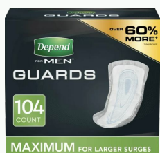
Male Incontinence Guard/Pads