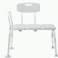
Transfer Bench without Glide Rail