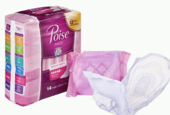
Female Incontinence Guard/Pads