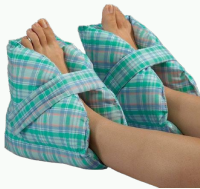
Heel Protection Pad