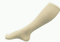
Leg Protection Sleeve