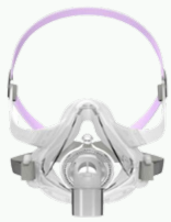
Full Face Mask