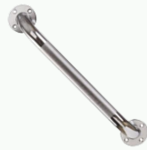
Permanent Grab Bar with Mounting Hardware 12", 16", 18", 24", 30", 32", 36", 42", or 48"