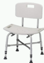
Shower Chair with Removable Back