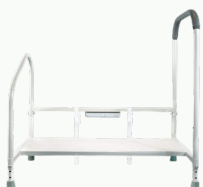
Step-2-Bed Bed Rail