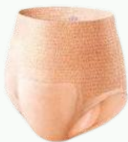
Female Incontinence Pull Ups