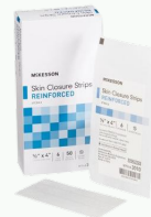
Skin Closure Strip