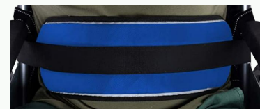
Wheelchair Seat Belt