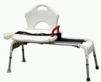
Sliding Bath Transfer Bench