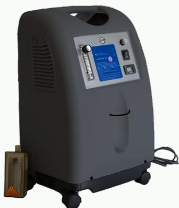
TrueAire 5 Machine