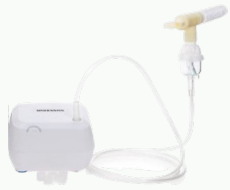
Nebulizer Mouthpiece or Updraft Masks