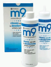
Ostomy Odor Control