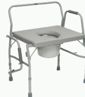
Bariatric Bedside Commode