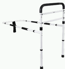
Adjustable Bed Assist Rail (for standard beds only)