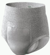
Male Incontinence Pull Ups