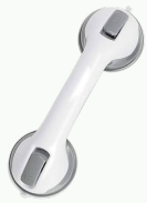
Suction Grab Bar 12" or 16"