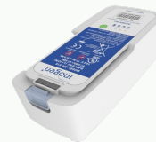
Inogen One G5 Extended Life Lithium Ion Battery Up to 13 hrs run time Item #BA-516