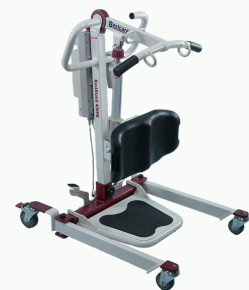
Stand Assist Lift with Sling/Strap