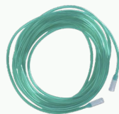
Oxygen Tubing & Connection Green or clear