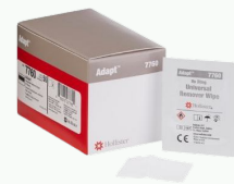
Adhesive and Barrier Remover