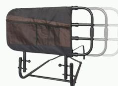
Fold-down Adjustable Bed Rail (for standard beds only)