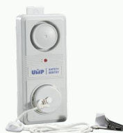
Pull Cord Alarm System