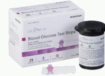
Glucose Strips & Lancets