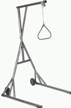
Free Standing or Mounted Trapeze