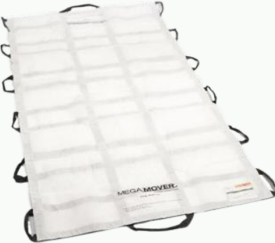
Transfer Sheet MegaMover