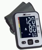
Automatic Blood Pressure Monitor