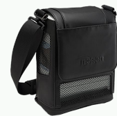
Inogen One G5 Carry Bag Item #CA-500