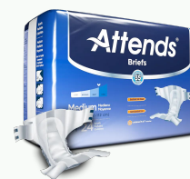
Unisex Incontinence Briefs (with tabs)