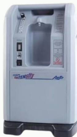
AirSep Intensity 10