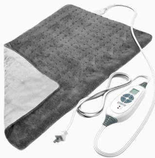
Dry/Moist Heating Pad