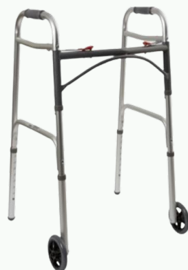
Walker with Wheels